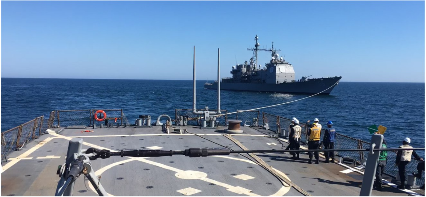
USS ARLEIGH BURKE towing USS LEYTE GULF during a training exercise in OCT 2016