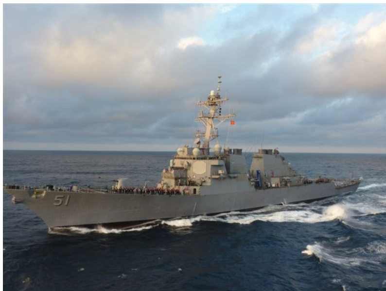
USS ARLEIGH BURKE coming alongside USNS SUPPLY during an OPFOR assignment with USS George H. W. Bush Carrier Strike Group C2X