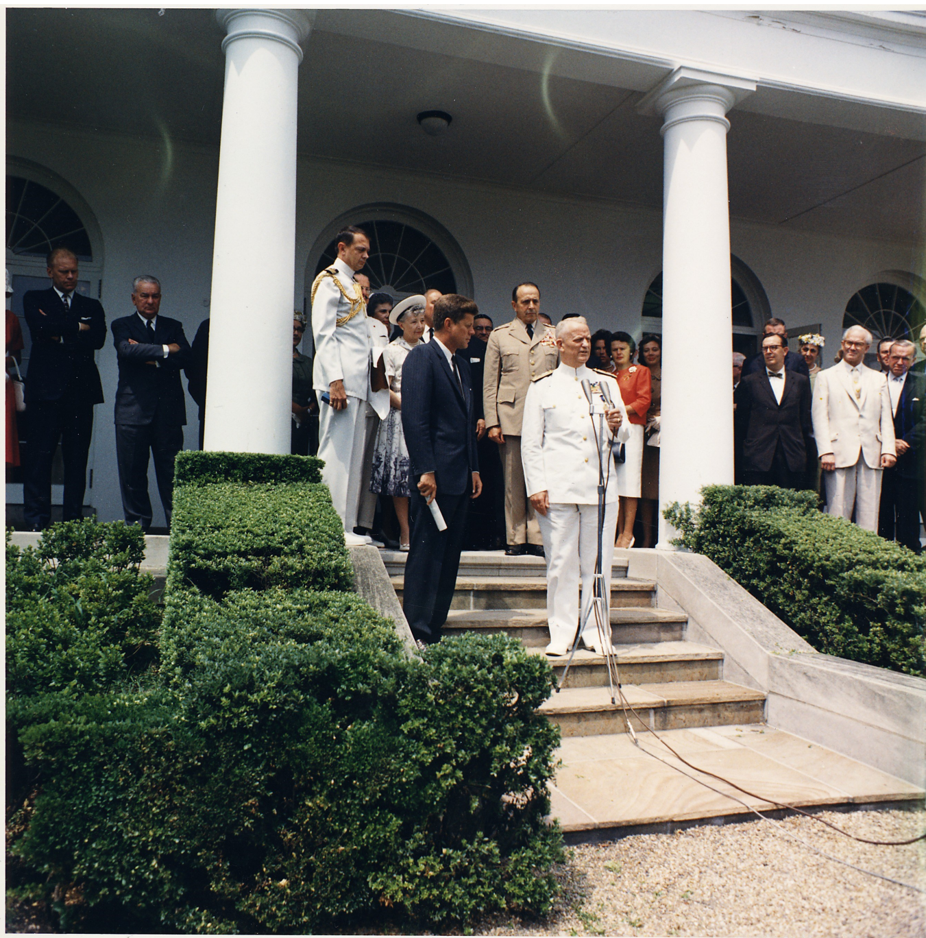
Presentation of the Distinguished Service Medal to Admiral Arleigh Burke by President Kennedy