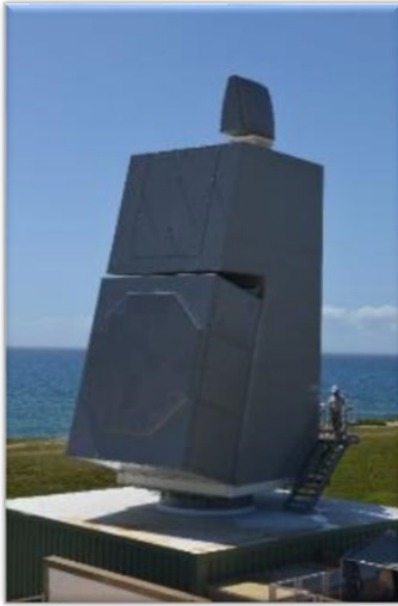
SPY-6(V)1 AMDR EDM Array in Far Field Range PMRF Advanced Radar Detection Lab (Kauai, HI)

(IAMD) capability. The AMDR requires additional power and cooling, and to meet that demand the design includes high voltage power technology first introduced on DDG 1000, and an enhanced A/C Plant upgrade. As of May 2017, the Flight III Design effort is more than 50% complete and on track