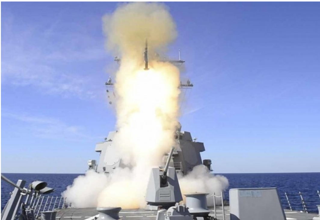
SM-2 Firing during DDG 113 Bravo Trials, October 2016.

In parallel with the ongoing construction of restart ships, the Flight III design upgrade is in development. It’s the largest design upgrade since the mid-1990s Flight IIA design upgrade, which was implemented for DDG 79 and follow. Flight III will bring twenty-first century technology to bear on a Navy ship hull design borne in the last century. Flight III’s core technology advancement is the SPY-6(V)1 Air and Missile Defense Radar (AMDR), which will provide improved sensitivity for long-range detection and engagement of advanced threats. Development and testing of AMDR is well underway with an Engineering Development Model (EDM) at the Pacific Missile Range Facility (PMRF) in Hawaii. Testing to date has yielded successful results in both Anti-Air Warfare (AAW) and Ballistic Missile Defense (BMD) scenarios which will meet the Navy’s need for Integrated Air and Missile Defense