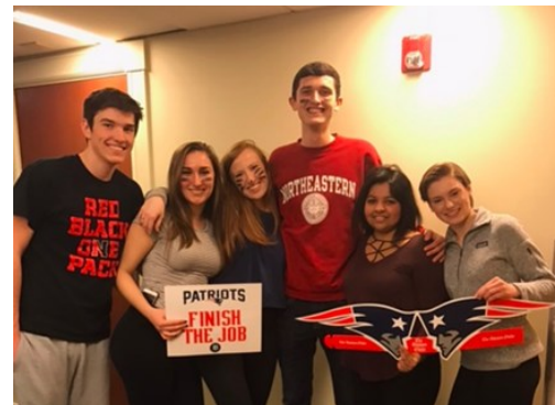
Getting ready to watch the Patriots win the Super Bowl!