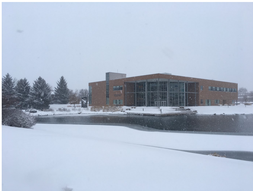
Campus in the snow

I have also enjoyed the challenge of leading our Supermileage engineering team, getting our cars ready for competition at the Shell Eco-marathon Americas this April in California (where we look to beat our 6th place finish from last year), and also the SAE Supermileage Competition in June. And I don't forget to take time occasionally to relax and recharge with my friends. Thank you all so much again for your support!