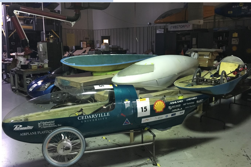
Supermileage cars in the engineering lab