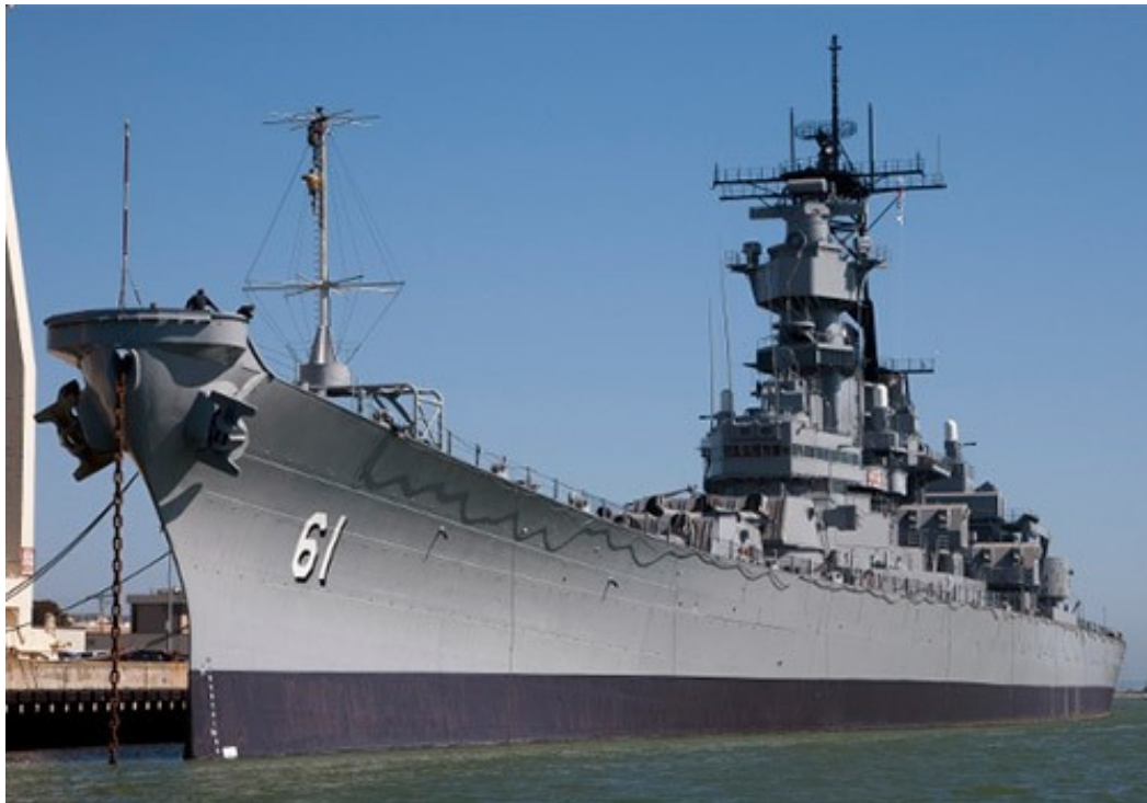
Battleship Iowa, Home of the Future National Museum of the Surface Navy, in the Port of Los Angeles