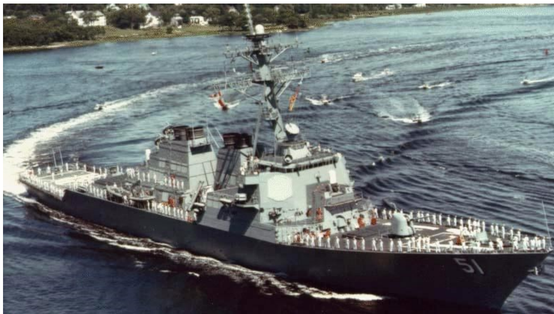
USS Arleigh Burke leaving Bath, ME