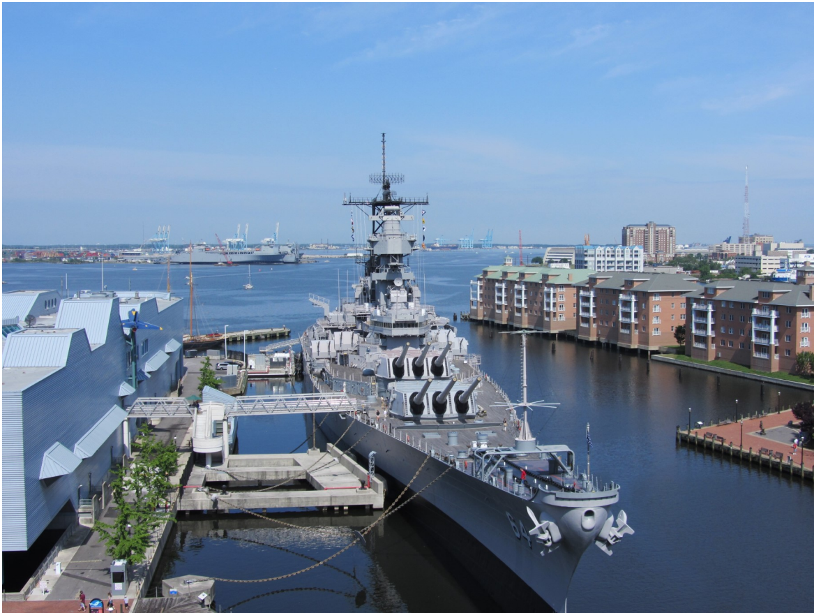
USS Wisconsin at Nauticus Waterside Downtown Norfolk - Site of the Upcoming 2019 Anchor Scholarship