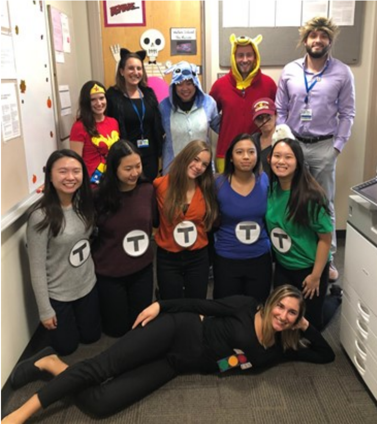
Happy Halloween from the Brigham & Women's Hospital Anticoagulation Management Service! The co-ops and I dressed up as the Boston MBTA subway.