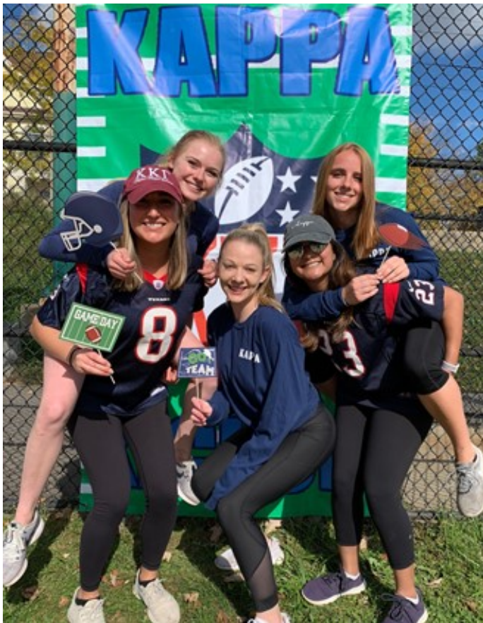
Visiting Cape Elizabeth in Maine to celebrate the New Year!