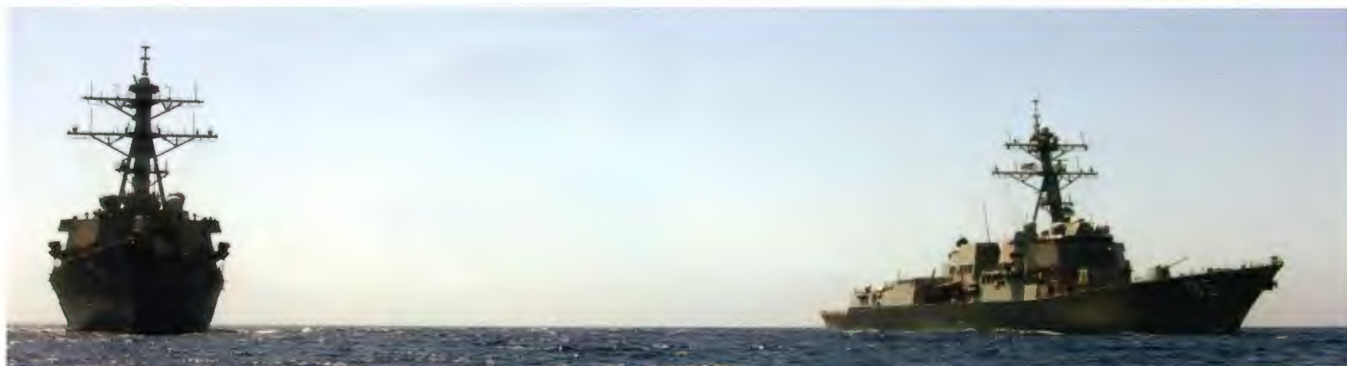
- Above - USS Arleigh Burke (left) operating with USS James E. Williams (right)