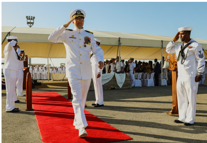
USS Arleigh Burke Change of Command