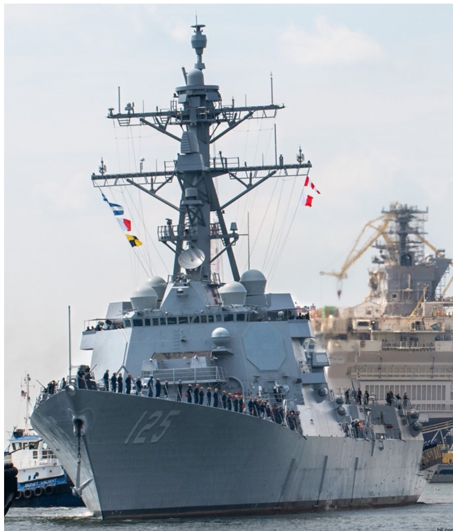
Future USS Jack H. Lucas departing Huntington Ingalls Shipbuilding, Pascagoula, Mississippi - September 2023