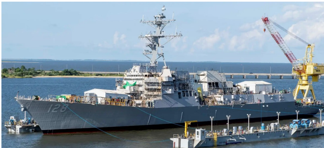
Future USS Ted Stevens launching at Huntington Ingalls Shipbuilding, Pascagoula, Mississippi in August 2023