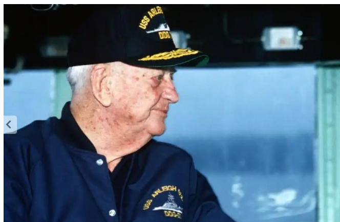
Admiral Burke during Alpha Trial