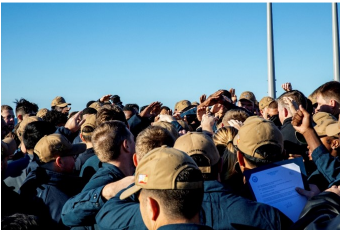
Sailors gather together after an awards ceremony, Nov 22, 2023.

Arleigh Burke departed Rota, Spain, on November 17th, 2023 after completing a comprehensive Surface Incremental Availability (SIA). 17.5 million dollars of repairs, alterations, and installations were performed to the ship's engineering, weapons, and combat systems, and the intensive Mobility-Engineering (MOB-E) certification was completed.