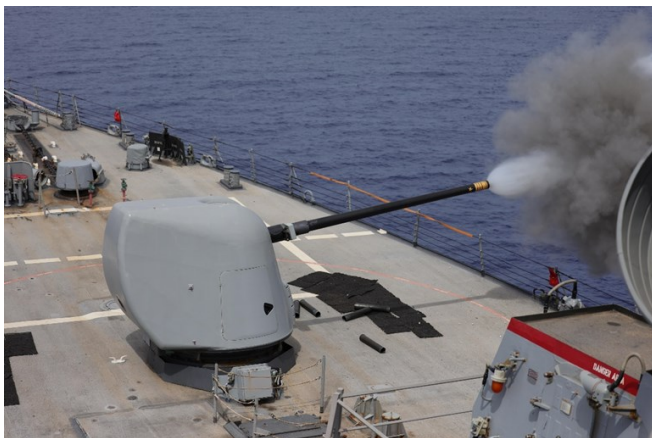
The guided-missile destroyer USS Arleigh Burke (DDG 51) fires her Mark 45 5-inch gun during a live-fire exercise,

With LOA complete, the ship was able to return to sea and successfully execute Sea Trials from May 12th through May 14th. With an aggressive schedule that included seamanship training, precision anchorage, anti-submarine warfare operations, flight deck operations, small boat evolutions, engineering checks, and Pre-Calibration Fire (PACFIRE) requirements for the 5-inch/54-caliber Mark 45 gun and the Phalanx CIWS, Sea Trials provided an opportunity to shake down, test, and evaluate critical systems prior to Patrol 6.