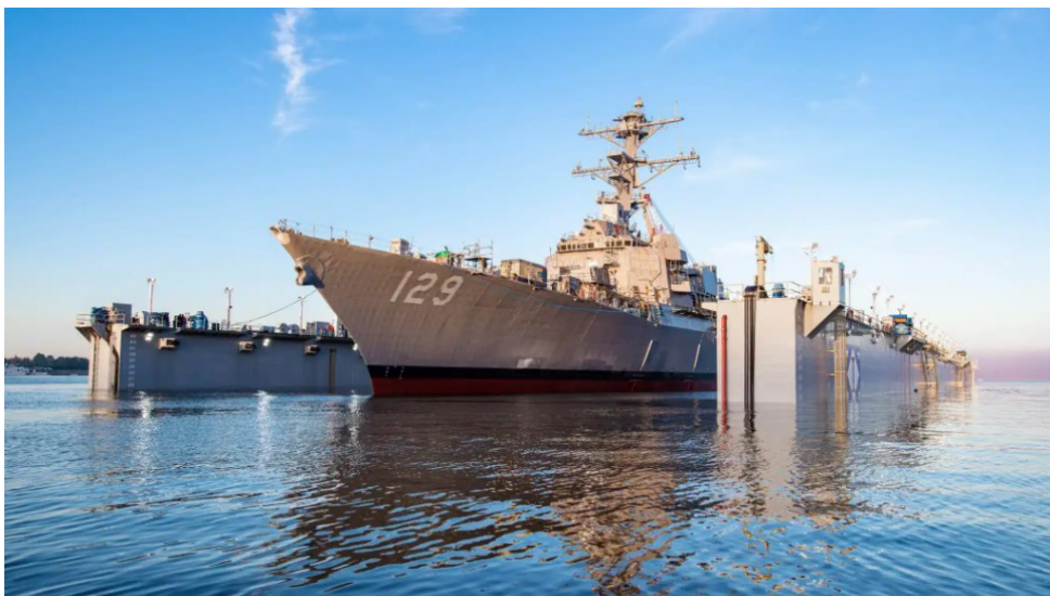
HII’s Ingalls Shipbuilding division successfully launched future USS Jeremiah Denton (DDG 129)