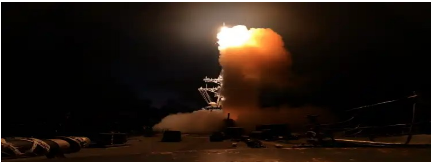
The USS Arleigh Burke (DDG 51) launches a Standard Missile-3 (SM-3) for ballistic missile interception at night in the Mediterranean Sea, March 29, 2026. Arleigh Burke is forward deployed to the U.S. 6th Fleet area of operations to support the warfighting effectiveness, lethality, and readiness of U.S. Naval Forces Europe-Africa, and defend U.S., Allied, and partner interests in the region."

Her crew's ability to successfully perform ballistic missile defense operations in stride while completing mission area certifications serves as a testament to their commitment and dedication to maintaining ARLEIGH BURKE's proud legacy. Through sustained readiness, precision operations, and seamless coordination with allied and joint forces, ARLEIGH BURKE continues to bolster global maritime security and maintain freedom of the high seas.