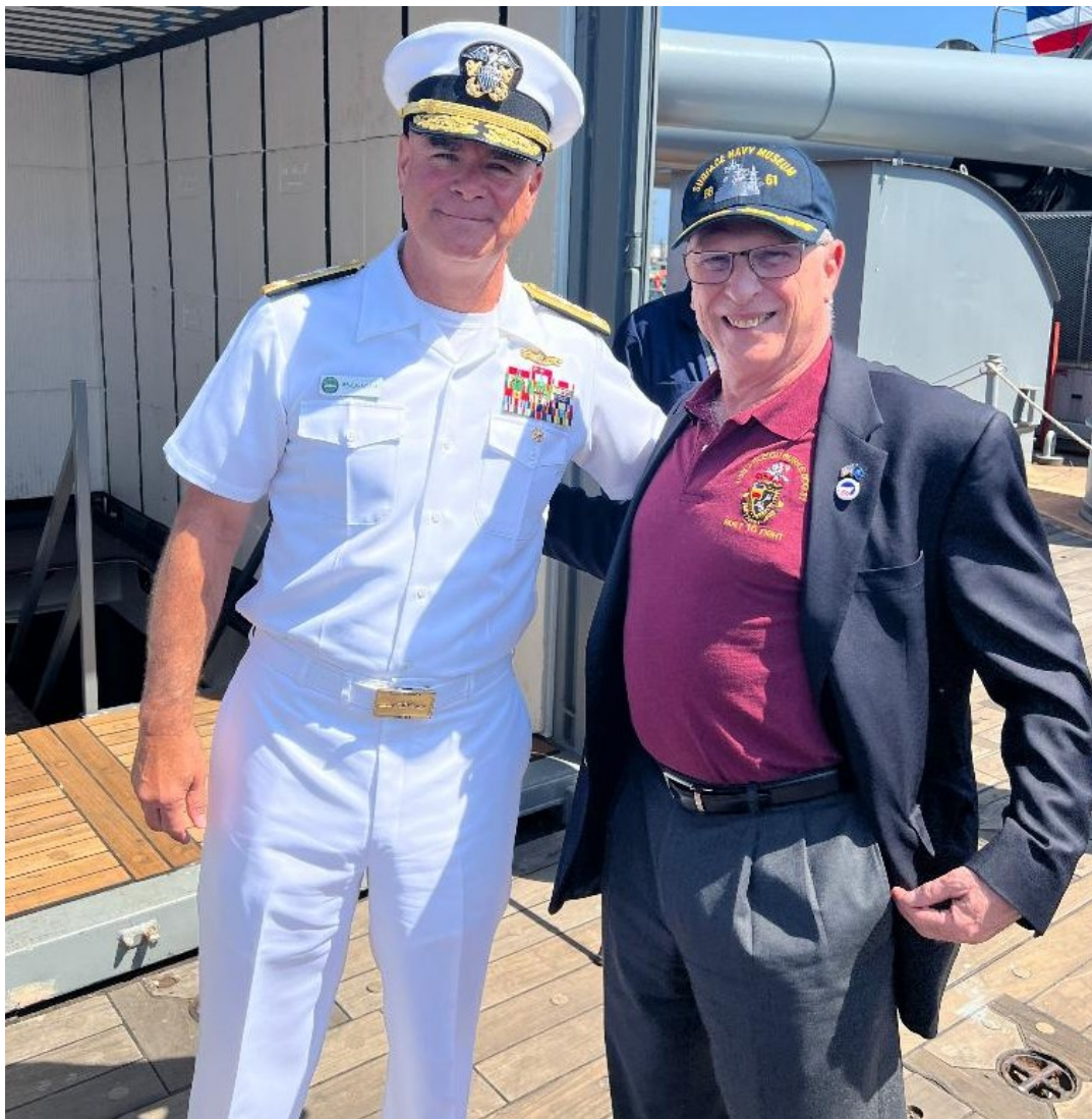
VADM Brendan McLane, Commander Naval Surface Forces with Rick Easton immediately following the official ribbon-cutting ceremony for the official opening of the new National Museum of the Surface Navy.